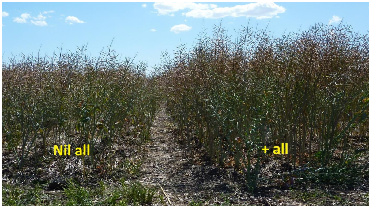
Figure 1. Visual differences in biomass vigour occurred between “Nil all” and “+ all” treatment at the canola omission trial site at Inverleigh, 2015.

Visually, at harvest there was a noticeable difference between the “Nil all” and “+ all” nutrient treatments, with “+ all” treatments showing higher levels of biomass (figure 1). Additional P produced a further 0.3 t/ha of canola, or a 22% increase in yield.