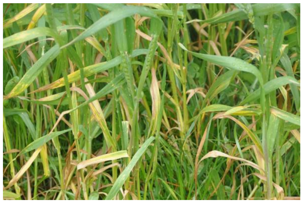
Figure 1, Symptoms of K deficiency seen in the wheat plots with nil K at the Glenthompson site, October 2016.

Even though the yield responses were inconclusive, the typical symptoms of K deficiency were seen on the wheat crop during mid-spring (Figure 1). Because K is highly mobile within plant tissue deficiency symptoms are generally visible on the older leaves first. Deficiency symptoms include scorching or burning along the leaf margins, and generally poor growth resulting in smaller root systems, small leaves, weak stems (inducing lodging in mature plants) and small and shrivelled grain, although these features were not seen in the harvested wheat grain.